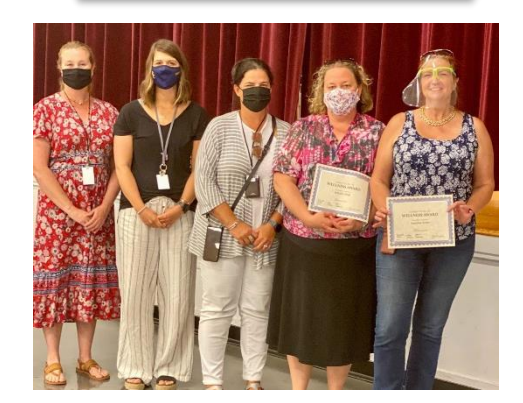
Focus on staff wellness: portal, strength & conditioning class, and awards (shown)