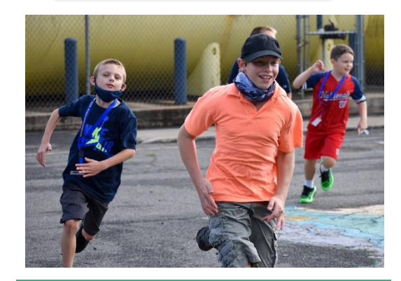
The Daily 15 to increase physical activity for students and teachers