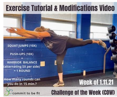
Virtual COW (Challenge of the Week)