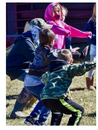
C2BF Activities at the Wonderful Wednesday Day Camp