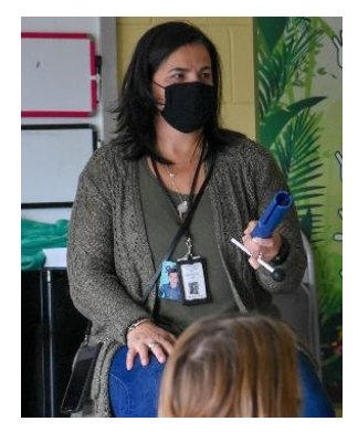
Mindfulness, nutrition, & positive self-esteem activities in ABL